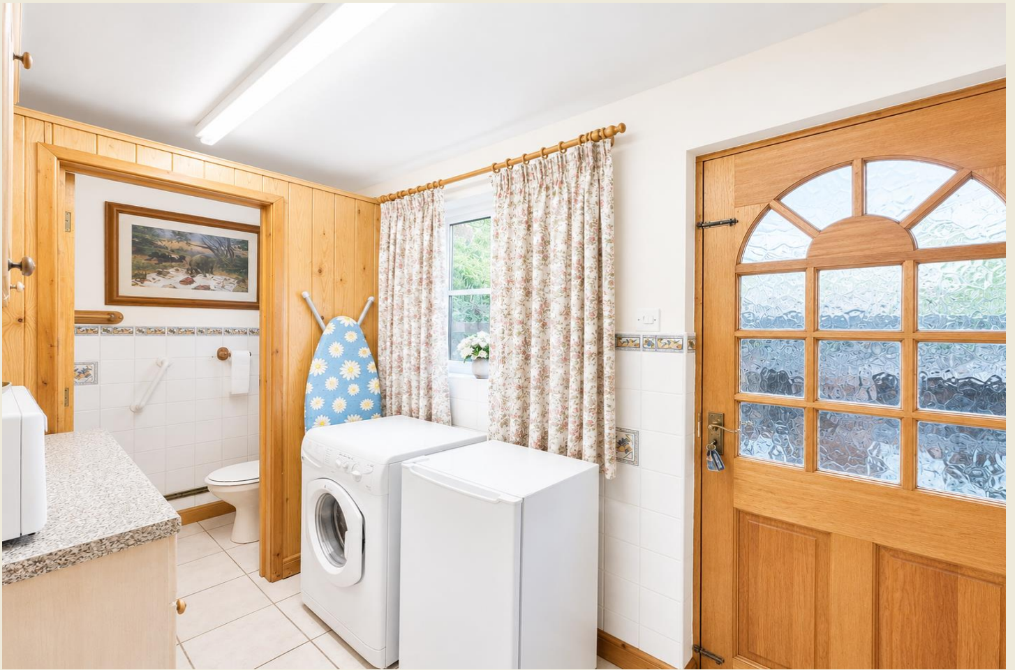
UTILITY ROOM 8'11 x 5'9