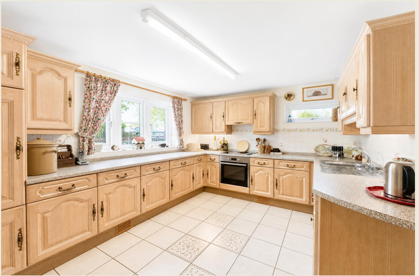
KITCHEN 12'2 x 10'2