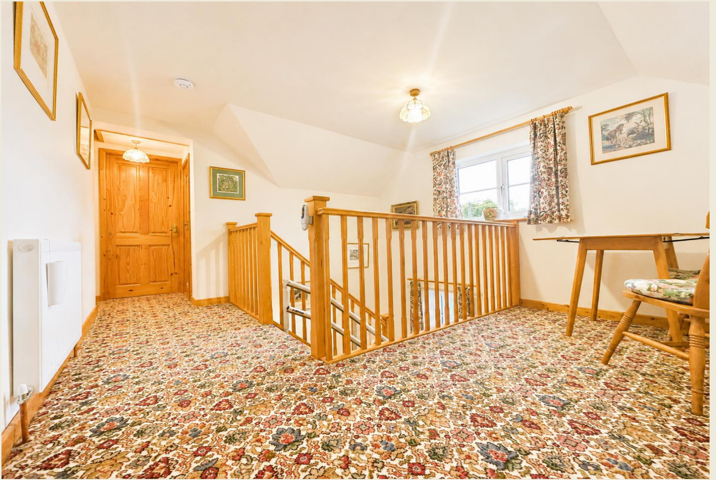
GALLERIED FIRST FLOOR LANDING WITH STUDY AREA 12'4 x 11'1