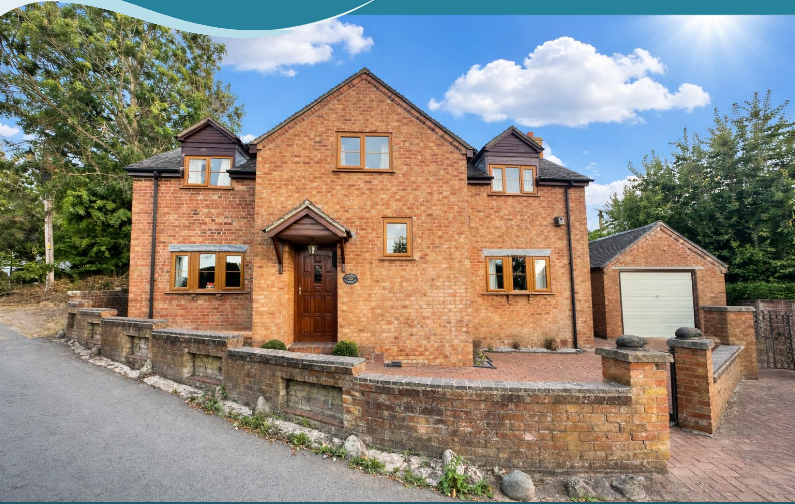
'CHURCH COTTAGE' | DAMSON LANE | COX BANK, AUDLEM | CHESHIRE | CW3 0EU | OFFERS OVER £375,000